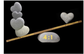
4:1-Connection Over Correction