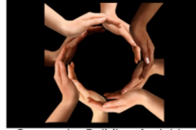
Community Building Activities